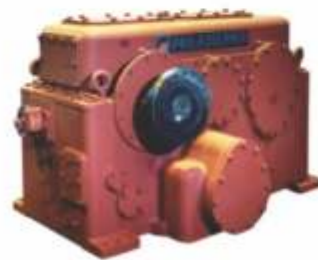
PHILADELPHIA GEARS (TIMKEN)

BRANDS : PHILADELPHIA GEAR, ABB, BALDOR MOTORS, GEARED-MOTORS.