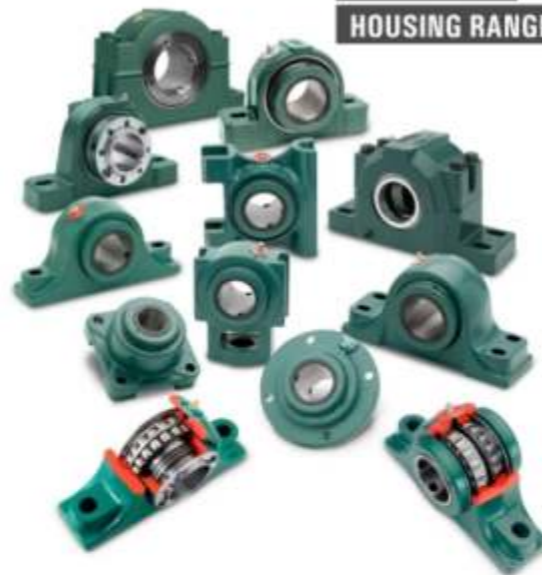
ABB - DODGE HOUSING RANGE

Nearly all mounted units do not reach their stated L10 life. Mounted bearings fail due to "CLI Disease - Contamination, Lubrication, Installation"